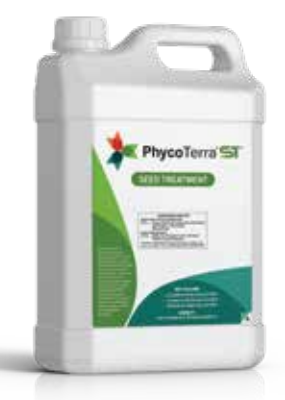
Available in 2x2.5-gallon jugs, 14-gallon kegs and 250-gallon totes.